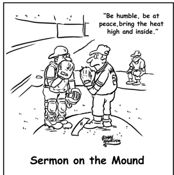
Sermon on the Mound

◆ The April council meeting has been canceled since the March meeting was held.